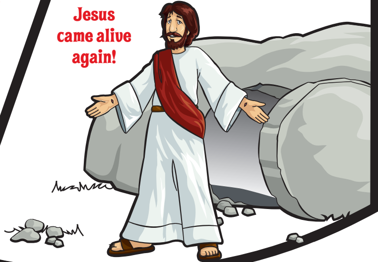
Jesus came alive again!

Basic Instructions: Tell your leader or another grown-up what is happening in each picture. Color the background of each picture.