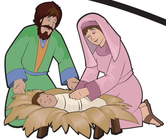
Jesus was born and laid in a manger.