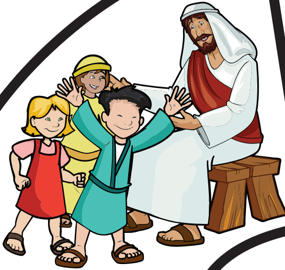
Jesus loved the children.